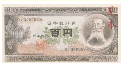
▲百円券<100yen> (76 × 148 mm) 肖像：板垣退助<Portrait : Taisuke Itagaki> 発行開始日<Date of first issue>：昭和28.12.1<Dec. 1,1953> 支払停止日<Issue suspended>：昭和49.8.1<Aug. 1,1974>