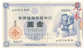
▲一円券<1yen> (78 × 135 mm) 肖像：大黒像<Portrait : Daikoku> 発行開始日<Date of first issue>：明治18.9.8<Sep. 8,1885> 支払停止日<Issue suspended>：昭和33.10.1<Oct. 1,1958>