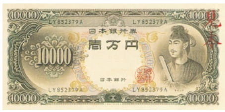
▲一万円券<10,000yen> (84 × 174 mm) 肖像：聖徳太子<Portrait : Shotoku Taishi> 発行開始日<Date of first issue>：昭和33.12.1<Dec. 1,1958> 支払停止日<Issue suspended>：昭和61.1.4<Jan. 4,1986>