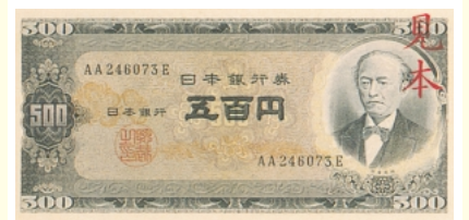
▲五百円券<500yen> (76 × 156 mm) 肖像：岩倉具視<Portrait : Tomomi Iwakura> 発行開始日<Date of first issue>：昭和26.4.2<Apr. 2,1951> 支払停止日<Issue suspended>：昭和46.1.4<Jan. 4,1971>