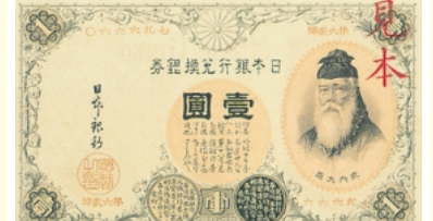
▲一円券<1yen> (85 × 145 mm) 肖像：武内宿禰<Portrait : Sukune Takenouchi> 記番号 漢字<Serial number in Chinese characters> 発行開始日<Date of first issue>：明治22.5.1<May. 1,1889> 記番号 英数字<Serial number in Arabic figures> 発行開始日<Date of first issue>：大正5.8.15<Aug. 15,1916> 支払停止日<Issue suspended>：昭和33.10.1<Oct. 1,1958>