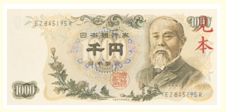
▲千円券<1,000yen> (76 × 164 mm) 肖像：伊藤博文<Portrait : Hirobumi Ito> 記番号 黒色<Serial number in black> 発行開始日<Date of first issue>：昭和38.11.1<Nov. 1,1963> 支払停止日<Issue suspended>：昭和61.1.4<Jan. 4,1986> 記番号 青色<Serial number in blue> 発行開始日<Date of first issue>：昭和51.7.1<Jul. 1,1976> 支払停止日<Issue suspended>：昭和61.1.4<Jan. 4,1986>