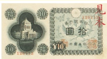
▲十円券<10yen> (76 × 140 mm) 図柄：国会議事堂<Design : The Diet Building> 発行開始日<Date of first issue>：昭和21.2.25<Feb. 25,1946> 支払停止日<Issue suspended>：昭和30.4.1<Apr. 1,1955>