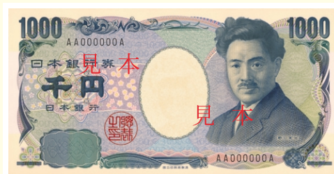
▲千円券<1,000yen> (76 × 150 mm) 肖像：野口英世<Portrait : Hideyo Noguchi>