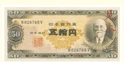
▲五十円券<50yen> (68 × 144 mm) 肖像：高橋是清<Portrait : Korekiyo Takahashi> 発行開始日<Date of first issue>：昭和26.12.1<Dec. 1,1951> 支払停止日<Issue suspended>：昭和33.10.1<Oct. 1,1958>