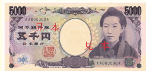
▲五千円券<5,000yen> (76 × 156 mm) 肖像：樋口一葉<Portrait : Ichiyo Higuchi>