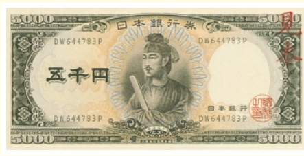
▲五千円券<5,000yen> (80 × 169 mm) 肖像：聖徳太子<Portrait : Shotoku Taishi> 発行開始日<Date of first issue>：昭和32.10.1<Oct. 1,1957> 支払停止日<Issue suspended>：昭和61.1.4<Jan. 4,1986>