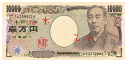
▲一万円券<10,000yen> (76 × 160 mm) 肖像：福沢諭吉<Portrait : Yukichi Fukuzawa>