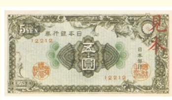
▲五円券<5yen> (68 × 132 mm) 図柄：彩紋<Design : Guilloche pattern> 発行開始日<Date of first issue>：昭和21.3.5<Mar. 5,1946> 支払停止日<Issue suspended>：昭和30.4.1<Apr. 1,1955>