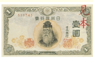
▲一円券<1yen> (70 × 122 mm) 肖像：武内宿禰<Portrait : Sukune Takenouchi> 発行開始日<Date of first issue>：昭和18.12.15<Dec. 15,1943> 支払停止日<Issue suspended>：昭和33.10.1<Oct. 1,1958>