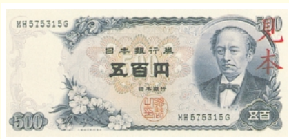
▲五百円券<500yen> (72 × 159 mm) 肖像：岩倉具視<Portrait : Tomomi Iwakura> 発行開始日<Date of first issue>：昭和44.11.1<Nov. 1,1969> 支払停止日<Issue suspended>：平成6.4.1<Apr. 1,1994>