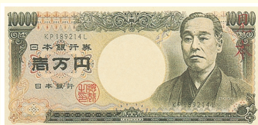
▲一万円券<10,000yen> (76 × 160 mm) 肖像：福沢諭吉<Portrait : Yukichi Fukuzawa> 記番号 黒色<Serial number in black> 発行開始日<Date of first issue>：昭和59.11.1<Nov. 1,1984> 記番号 褐色<Serial number in brown> 発行開始日<Date of first issue>：平成5.12.1<Dec. 1,1993>