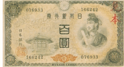
▲百円券<100yen> (93 × 162 mm) 肖像：聖徳太子<Portrait : Shotoku Taishi> 発行開始日<Date of first issue>：昭和21.2.25<Feb. 25,1946> 支払停止日<Issue suspended>：昭和31.6.5<Jun. 5,1956> (注) 中央「百圓」の文字の下にある赤色標識がなく、裏面模様が赤い色のものは失効券です。ご注意ください。 Note: The banknote without red mark in the center bottom is no legal tender.