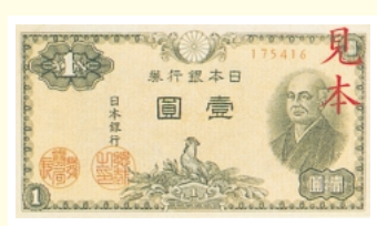
▲一円券<1yen> (68 × 124 mm) 肖像：二宮尊徳<Portrait : Sontoku Ninomiya> 発行開始日<Date of first issue>：昭和21.3.19<Mar. 19,1946> 支払停止日<Issue suspended>：昭和33.10.1<Oct. 1,1958>