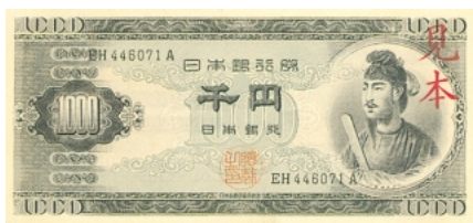
▲千円券<1,000yen> (76 × 164 mm) 肖像：聖徳太子<Portrait : Shotoku Taishi> 発行開始日<Date of first issue>：昭和25.1.7<Jan. 7,1950> 支払停止日<Issue suspended>：昭和40.1.4<Jan. 4,1965>