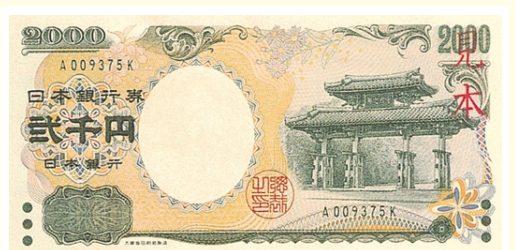
▲二千円券<2,000yen> (76 × 154 mm) 図柄：守礼門<Design : Shurei-mon Gate> 発行開始日<Date of first issue>：平成12.7.19<Jul. 19,2000>